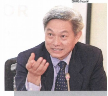
DDHOE / FocusM

"It is for investor protection that such rules are in place especially after past