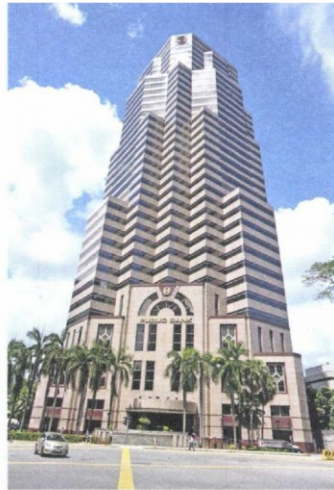
Of entrepreneur driven stocks, Public Bank Bhd came out tops

BAT and AMMB Holdings Bhd also climbed up the rankings after they took steps to disclose their AGM minutes.